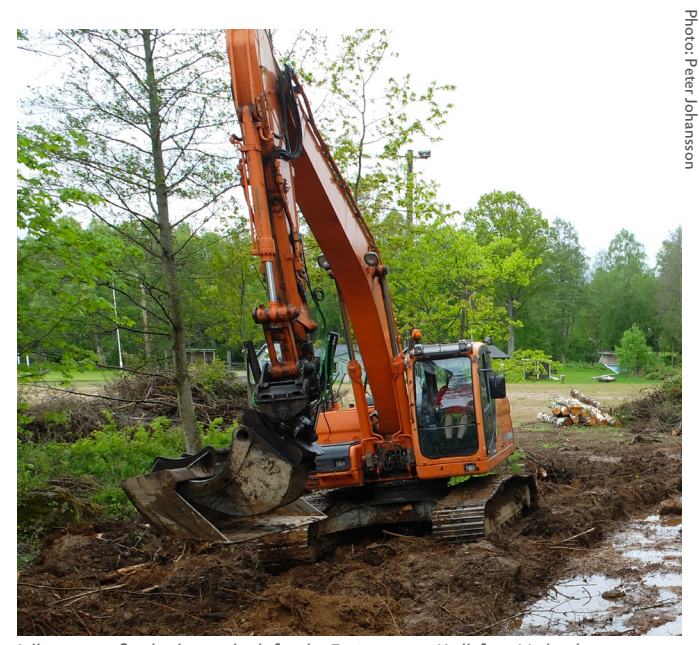
Lillån, an artificial tributary built for the Emån river at Kvillsfors, Vetlanda. Initial digging for the Turefors circulation, began in June 2015.