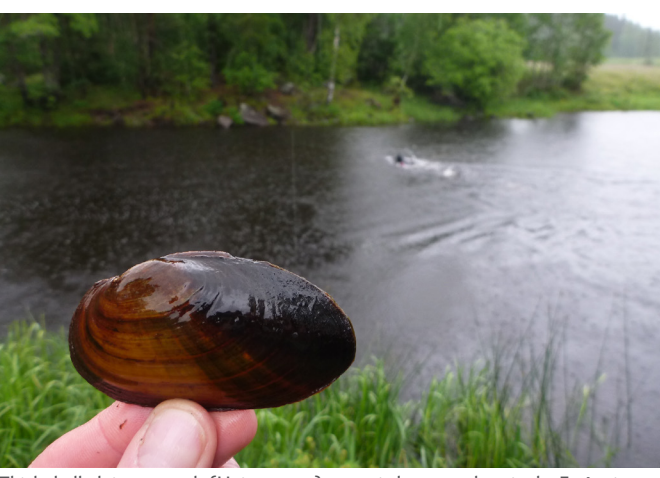
Thick shelled river mussels (Unio crassus), occur in large numbers in the Emån river, downstream from Kvillsfors, Vetlanda

The program was paid for by the Swedish Agency for Marine and Water Management, the Swedish Energy Agency, as well as by a number of hydropower companies. The KLIV program group, which has followed the programs activities, was also represented by the Swedish Agency for Marine and Water Management. Energiforsk has been instrumental in the Power and Aquatic Life program.